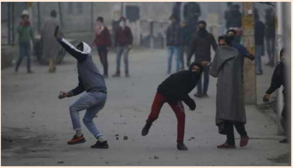
Stone pelters have interfered in army operations in Kashmir, seeking to distract their attention to help militant gunmen escape.

A group of students of the Indian Institute of Technology-Madras has developed an artificial intelligence-based technology for predicting crowd behaviour and offered it to the army for possible use in J&K to deal with stone pelters who attack security forces.