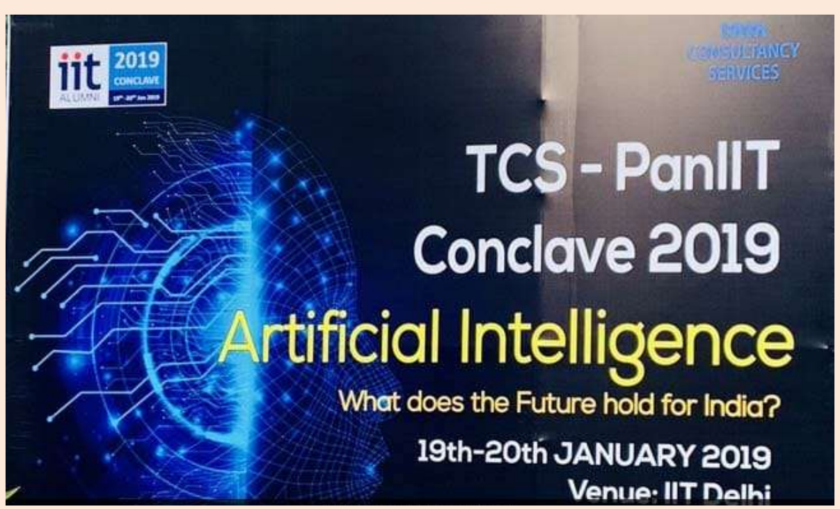
Pan IIT Conclave 2019: Artificial Intelligence, Its Future in India

This year the conclave is also hosting the first Pan IIT AI Hackathon 2019 to promote AI and ML among the wider community of young software and AI professionals.