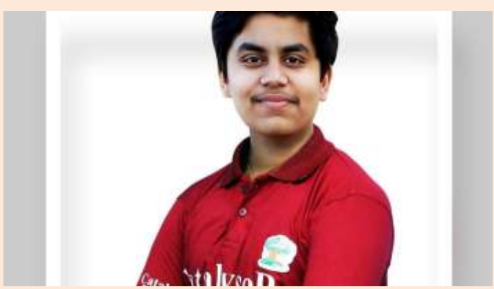
17-year-old JEE Main 2019 topper reveals his strategy of scoring 100 percentile |interview|

JEE Main Result 2019 : The National Testing Agency (NTA) has announced the Joint Entrance Examination (JEE) Main Results 2019 today, i.e. January 19. All the candidates can check their scores on the official website of JEE, the link for which is jeemain.nic.in